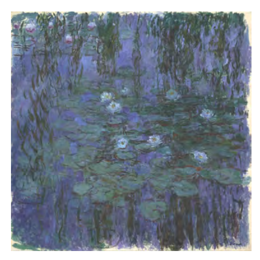
Blue Water Lilies by Claude Monet

In the Musée d'Orsay you will enjoy one of the largest collections of Impressionist and post-Impressionist art in the world! The building used to be a railway station, and it is a work of art in itself! Don't miss the famous clock face, which is part of the museum's exhibition where you can look out on the Seine.